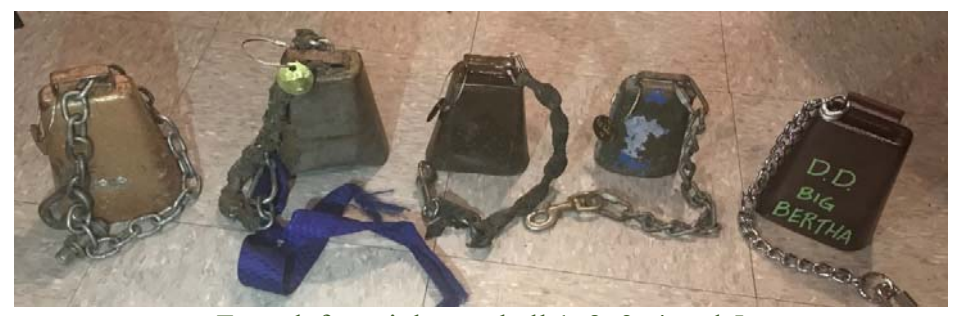
From left to right cowbell 1, 2, 3, 4 and 5